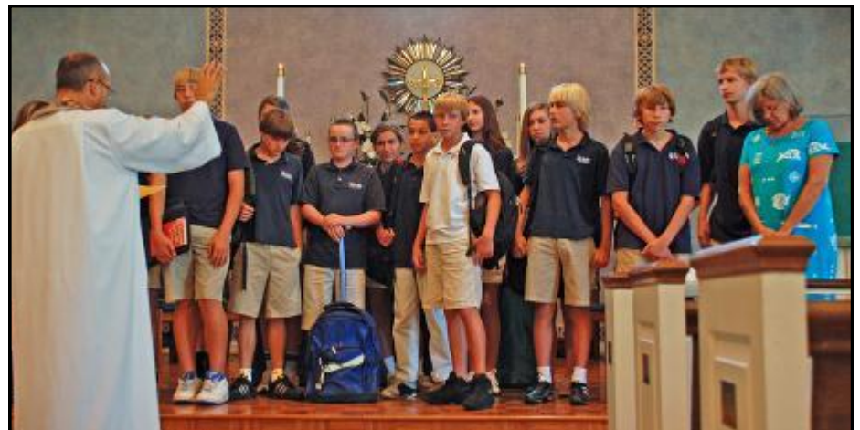
The Class of 2012 receives their blessing as they begin their "senior" year at St. Martin's-in-the-Field Day School.